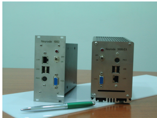
Figure-2 Neurode-1000 and Neurode-3000 series